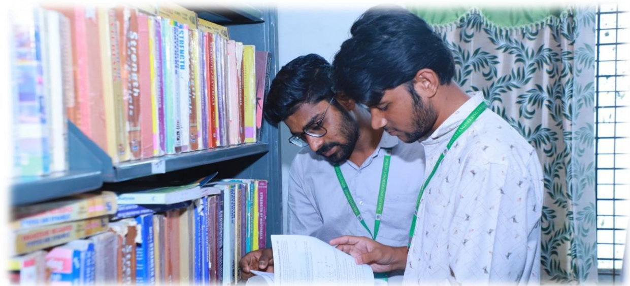
Stack room of Library with ample number of books, monographs and CDs, and digital resources (Main Building)