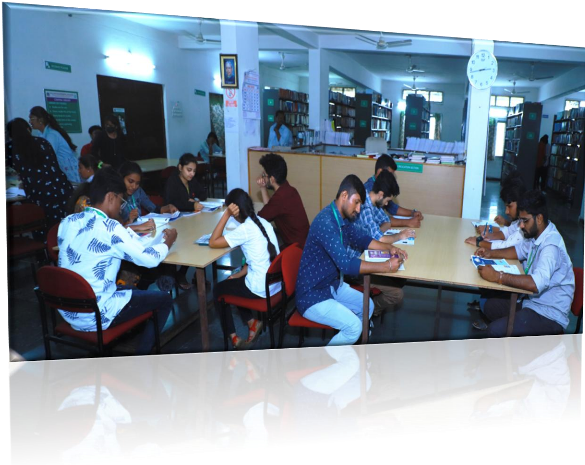
Library reading hall with plenteous infrastructure and resources (Main Building)